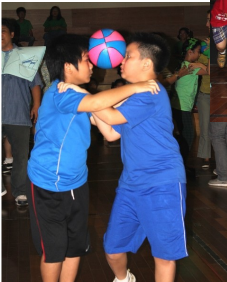
Things get up close and personal...